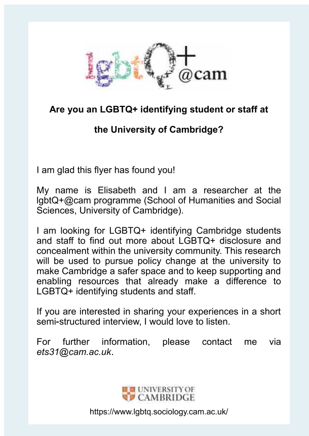
Figure 1, Research flyer for recruiting participants